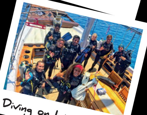
Diving on Liveaboard