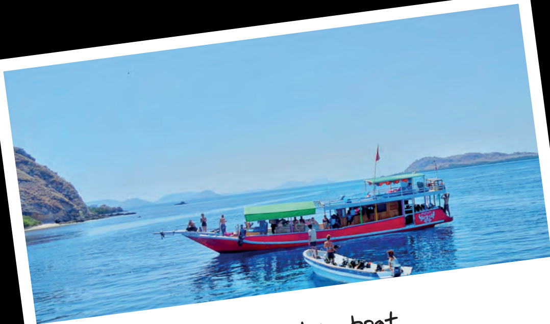
Our daily diving boat