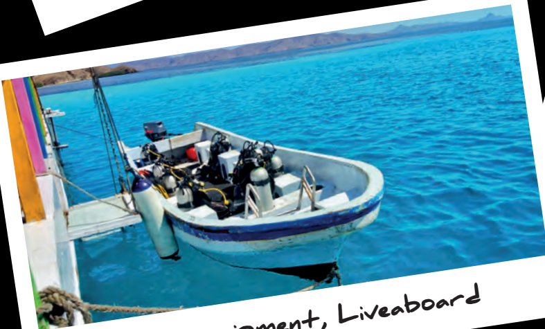
Diving equipment, Liveaboard