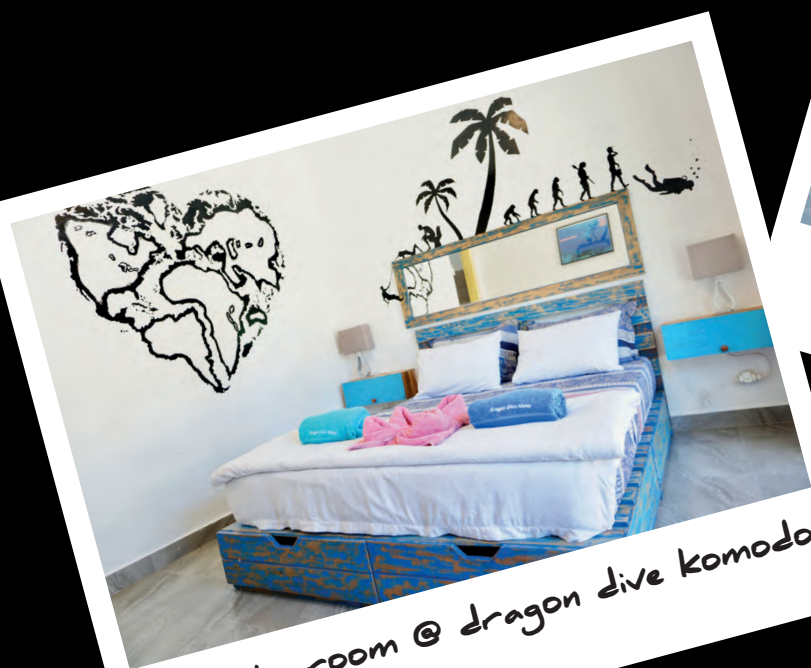
Private room @ dragon dive komodo