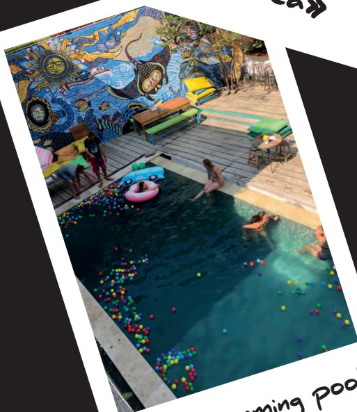
Our swimming pool