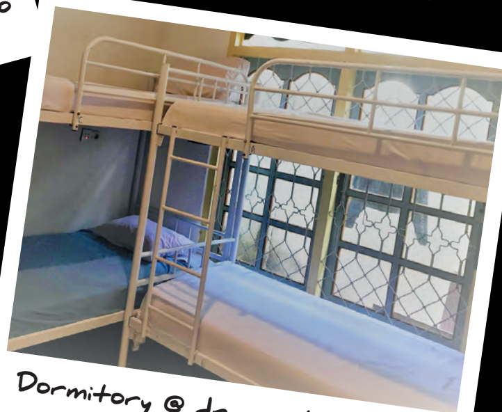
Dormitory @ dragon dive komodo