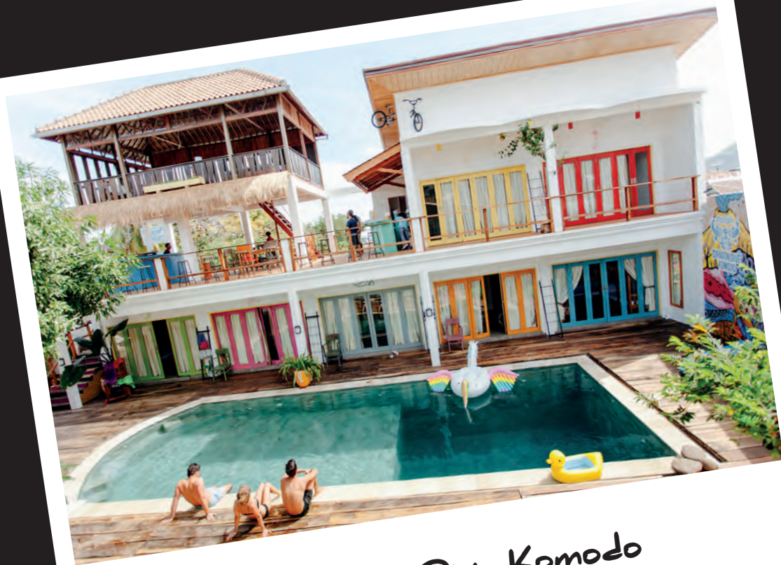
Dragon Dive Komodo